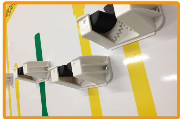
Wall mounted, free standing or mobile.

BESPOKE 5S SHADOWBOARDS & CLEANING STATIONS